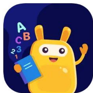
SplashLearn: Kids Learning App