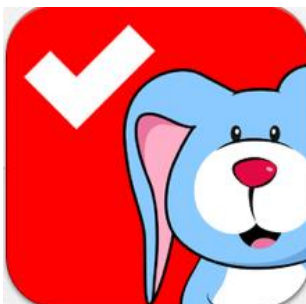
Maths Age 3-5