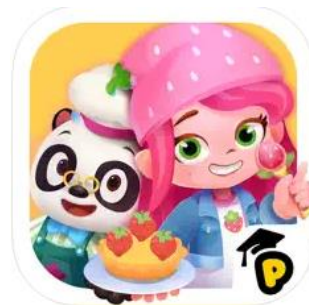
Dr. Panda Town Tales: New Life