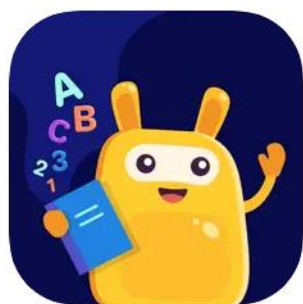
SplashLearn: Kids Learning App