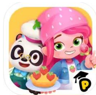
Dr. Panda Town Tales: New Life