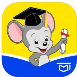
ABCMouse: Reading and Maths Games