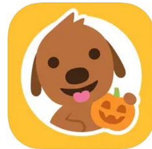
Sago Mini World: Kids Games