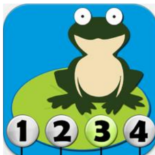
Teaching Number Lines