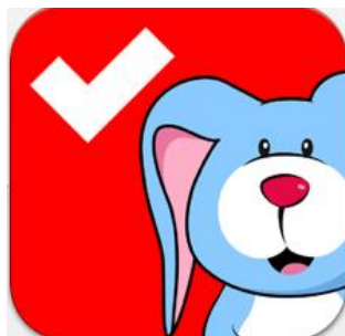
Maths Age 3-5