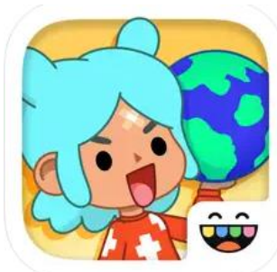
Toca Boca World (Creating and Explore Your Story)